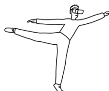
PERFORMING A LITURGICAL DANCE